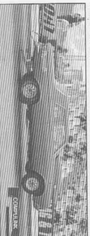
■ Dave Lewien carries the front wheels of his '64 Plymouth Belvedere to another 9.50 pass. The big 556 Wedge engine is topped by win 1150 Dominator carbs and, wouldn't you know it? According to Dave, it drinks gas!