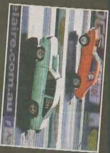
BUILT FOR SPEED: Cars take to Willowbank's track in preparation for next weekend's Winternationals.

Drivers even had to pass a medical exam and obtain a doctor's certificate to ensure they were fit and to reduce the chance of accidents.