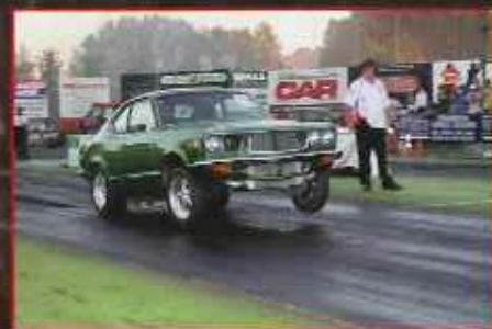
Watch out for stock appearing RX3 in the traffic. Jeremy Abbott posted a 9.641 ET...no kidding! MA.