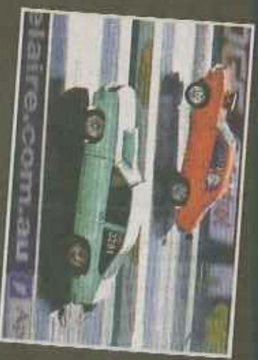
BUILT FOR SPEED: Cars take to Willowbank's track in preparation for next weekend's Winternationals.

Drivers even had to pass a medical exam and obtain a doctor's certificate to ensure they were fit and to reduce the chance of accidents.